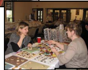
March 5th—6th Texas State Button Collection Convention at the Doss Center