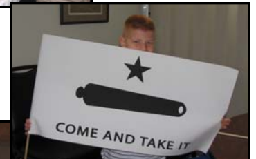
Doss Wranglers March 6th, "Remember the Alamo!"